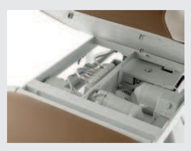
All motors are designed for minimal maintenance and ease of servicing.