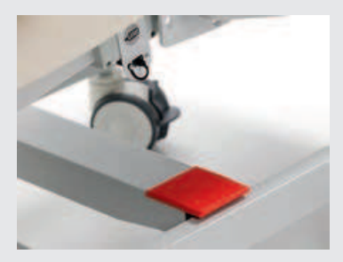
The large foot switch allows the head-down position to be achieved rapidly and with ease.