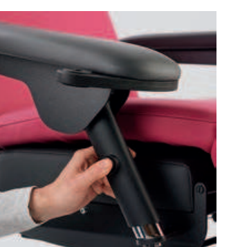
The stable armrests can be lowered into various positions at the touch of a button, allowing them to be conveniently adjusted for the patient's comfort.

The surfaces of the chair are hard-wearing having minimal seams, which makes cleaning easier and reduces wear and tear.